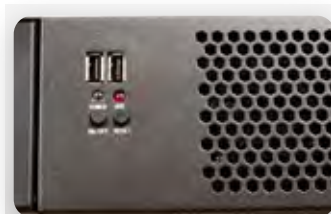
2x USB 2.0 Power + HDD LED Indicators Power + Reset switch